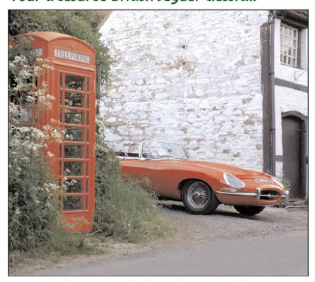
...deserves the best in Stateside service!