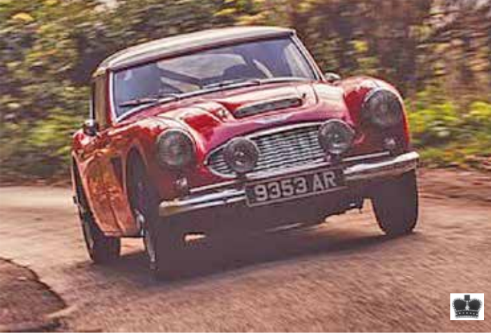
"Surprisingly, the Austin-Healey 3000 was voted above the Mini in the St George's Day celebration survey"