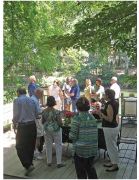
Photo of last years Jags & Friends Picnic