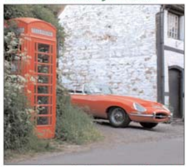
...deserves the best in Stateside service!