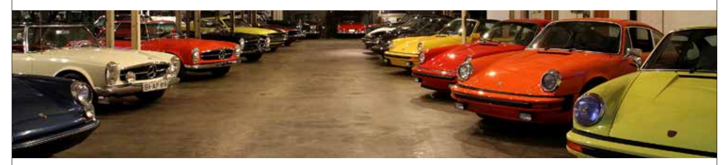
MOTORCAR STUDIO SPORTS · CLASSICS · SALES · BROKERAGE

Brokering significant Atlanta-area cars to buyers worldwide since 2012. Thinking about selling? Call us today to discuss consignment options for your Jaguar.