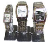
Jaguar GUESS watches. Mens and womens are available!