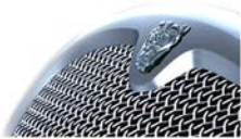
Jaguar mesh grilles are available for most late model vehicles from 1988 and up!

Specializing in XK's, E-Types, XJ's, XJS's and Late model Jaguar spares