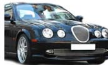
S-Type Lower Mesh Grille Inserts Chrome plated stainless steel. XR8-46158 Only $225.00