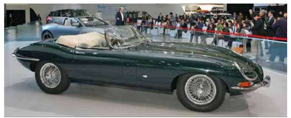
The first roadster 77 RW, and the last, HDU 555N

Jaguar Daimler Heritage Trust (JDHT) Is Planning A Tour To Geneva in March 2021 To Celebrate The 60th Anniversary Of The Launch Of The Jaguar E-type. From Jaguar Daimler Heritage Trust