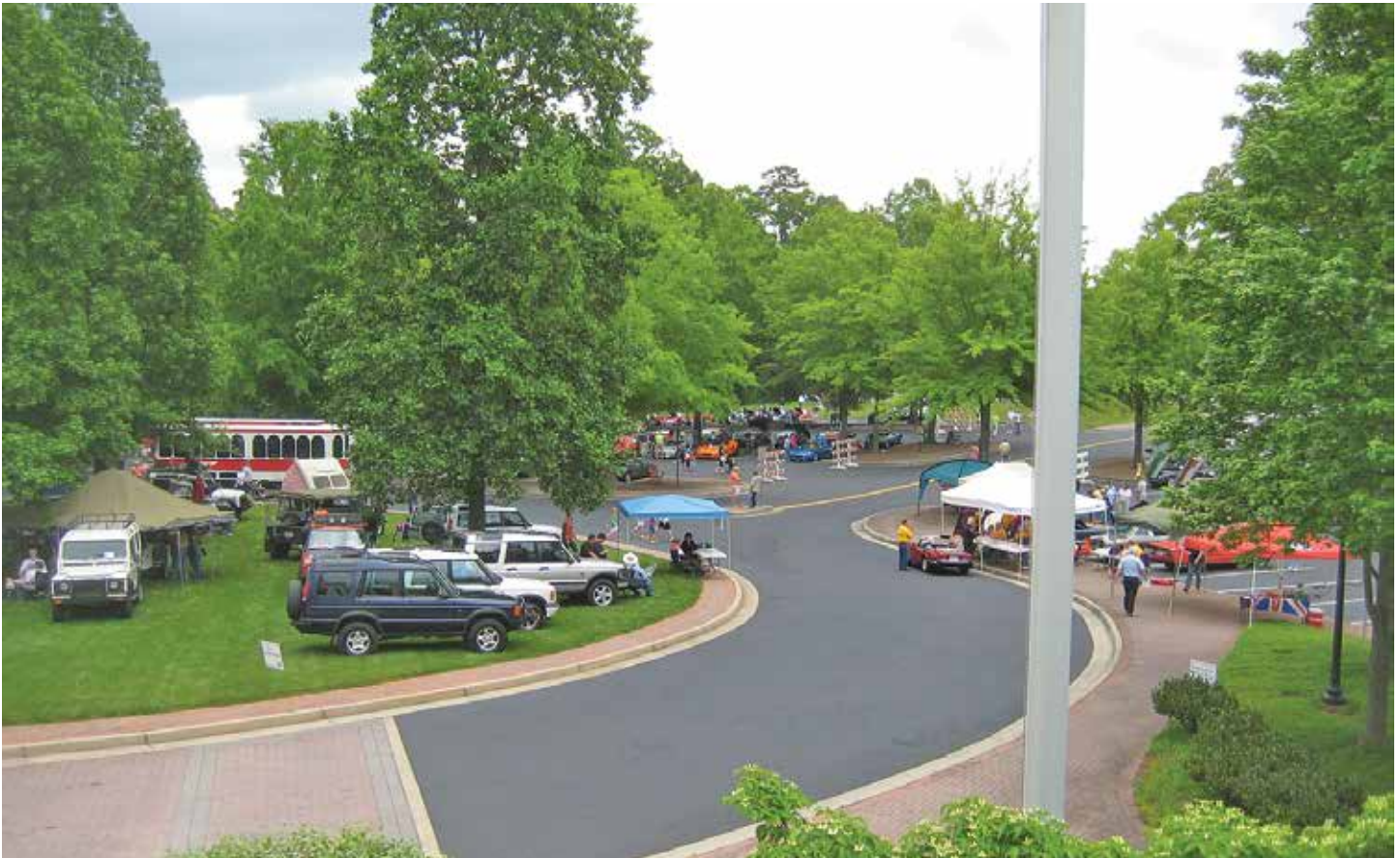
Continued on page 6

The most important factors to consider in choosing a Jaguar parts vendor are EXPERIENCE and KNOWLEDGE .