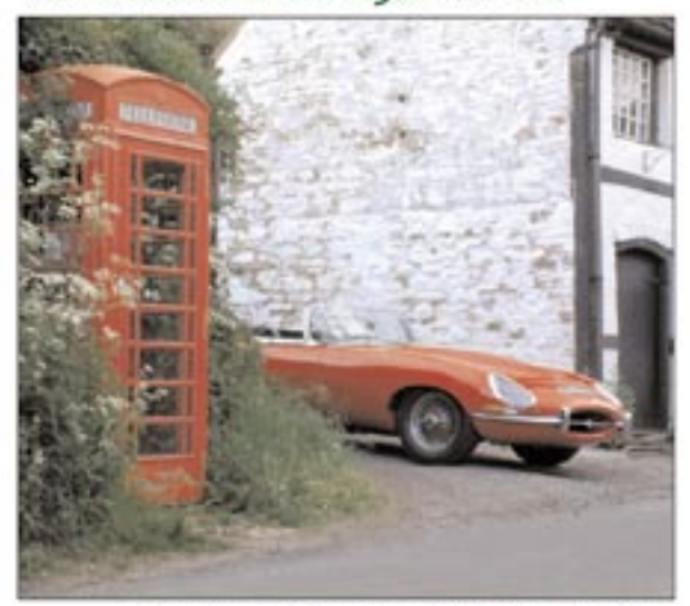
...deserves the best in Stateside service!