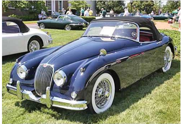
Championship Challenge Page 4