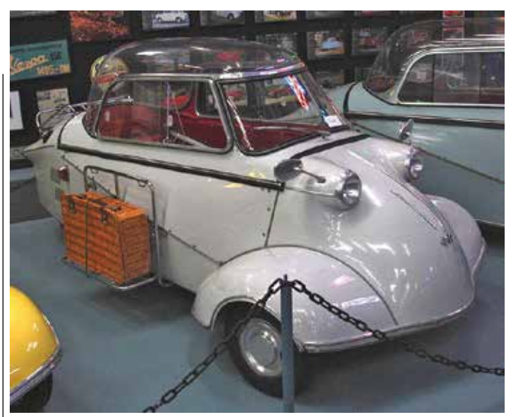
PAGE 6 - Visit To Microcar Museum