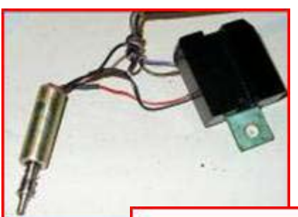
I can make this