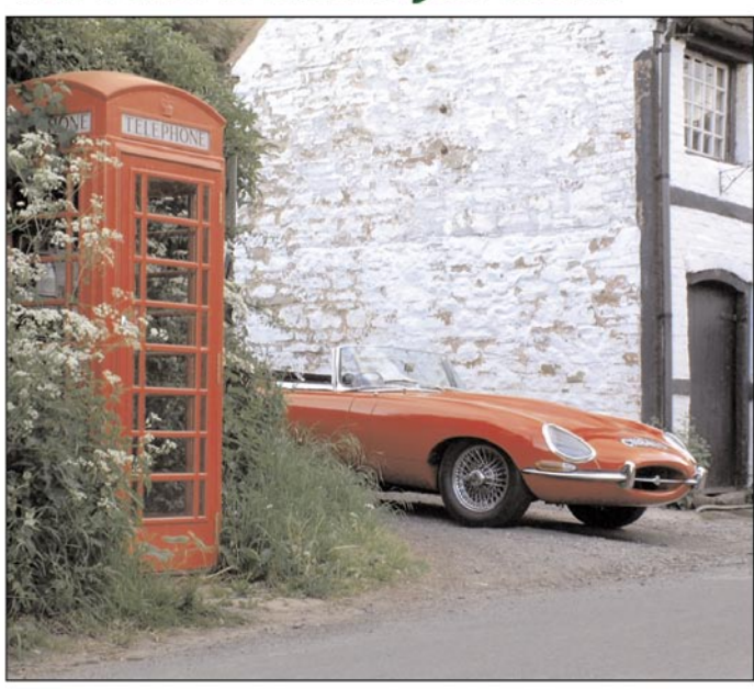
...deserves the best in Stateside service!