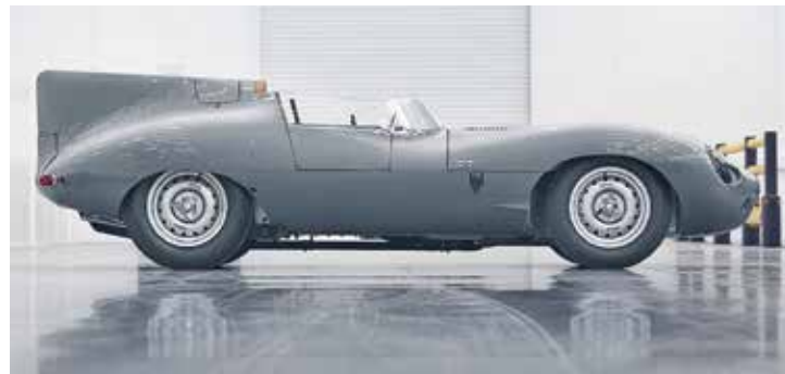
Jaguar Classic D-Type makes its debut at Rétromobile 2018 in Paris