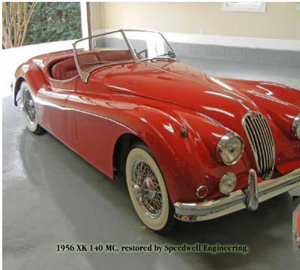
1956 XK 140 MC, restored by Speedwell Engineering.