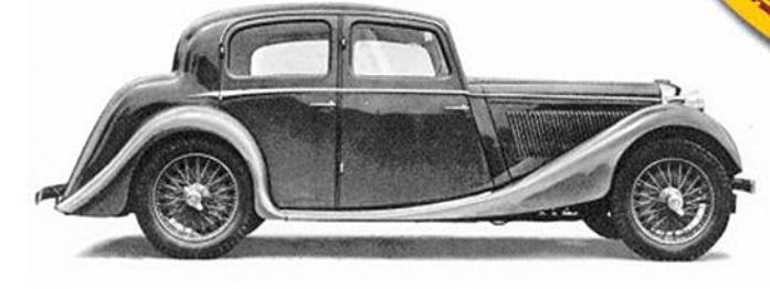
The very first SS Jaguar was a good looking four seater saloon, which looked as though it would cost 1000, but it only cost 385 with 2 litre Standard-designed six cylinder engine.