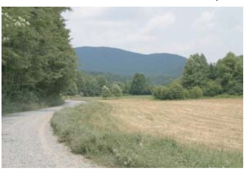
Dreamin' of summer Rich Mountain Road

produced as early as 2005. It will be interesting to see how much of this actually happens. It certainly sounds encouraging for the future of Jaguar.