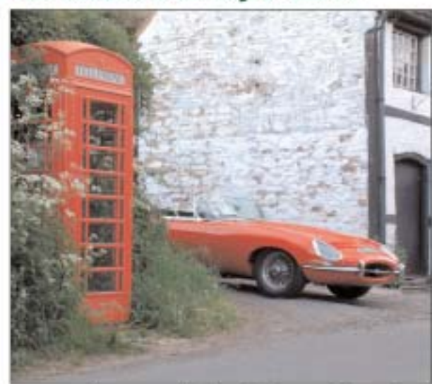
...deserves the best in Stateside service!