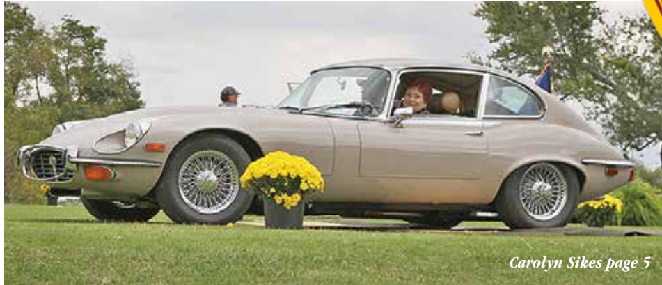
Carolyn Sikes page 5