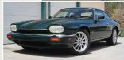
LATE-MODEL PARTS AND ACCESSORIES