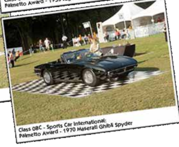
Class 08C - Sports Car International: Palmetto Award - 1970 Maserati Ghibli Spider