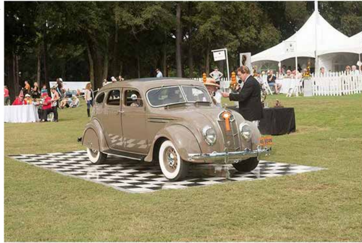
Class 03A2 - Honored Marque - Chrysler Corp 1916-1973: The Best Car for Driving on Vacation - 1935 DeSoto Airflow Sedan