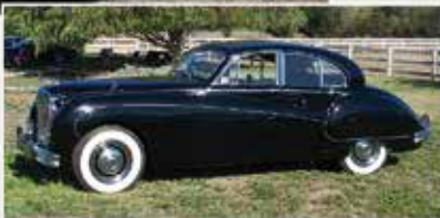
EARLY SEDAN PARTS AND ACCESSORIES