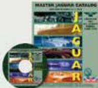
INDUSTRY STANDARD MASTER JAGUAR CATALOG