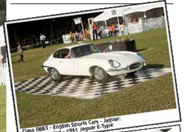
Class 08B3 - English Sports Cars - Jaguar: Palmetto Award - 1961 Jaguar E-Type