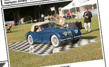
Class 08B3 - English Sports Cars - Jaguar: Palmetto Award - 1953 Jaguar XK190 SE