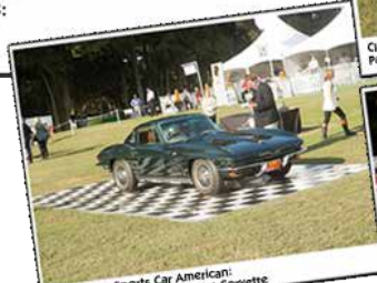
Class 08A - Sports Car American: Best in Class - 1965 Chevrolet Corvette