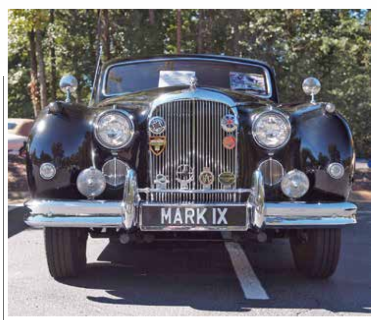
Photography by Frank Sessions

Visit To Adaptive Mobility Systems Saturday, January 17, 2015