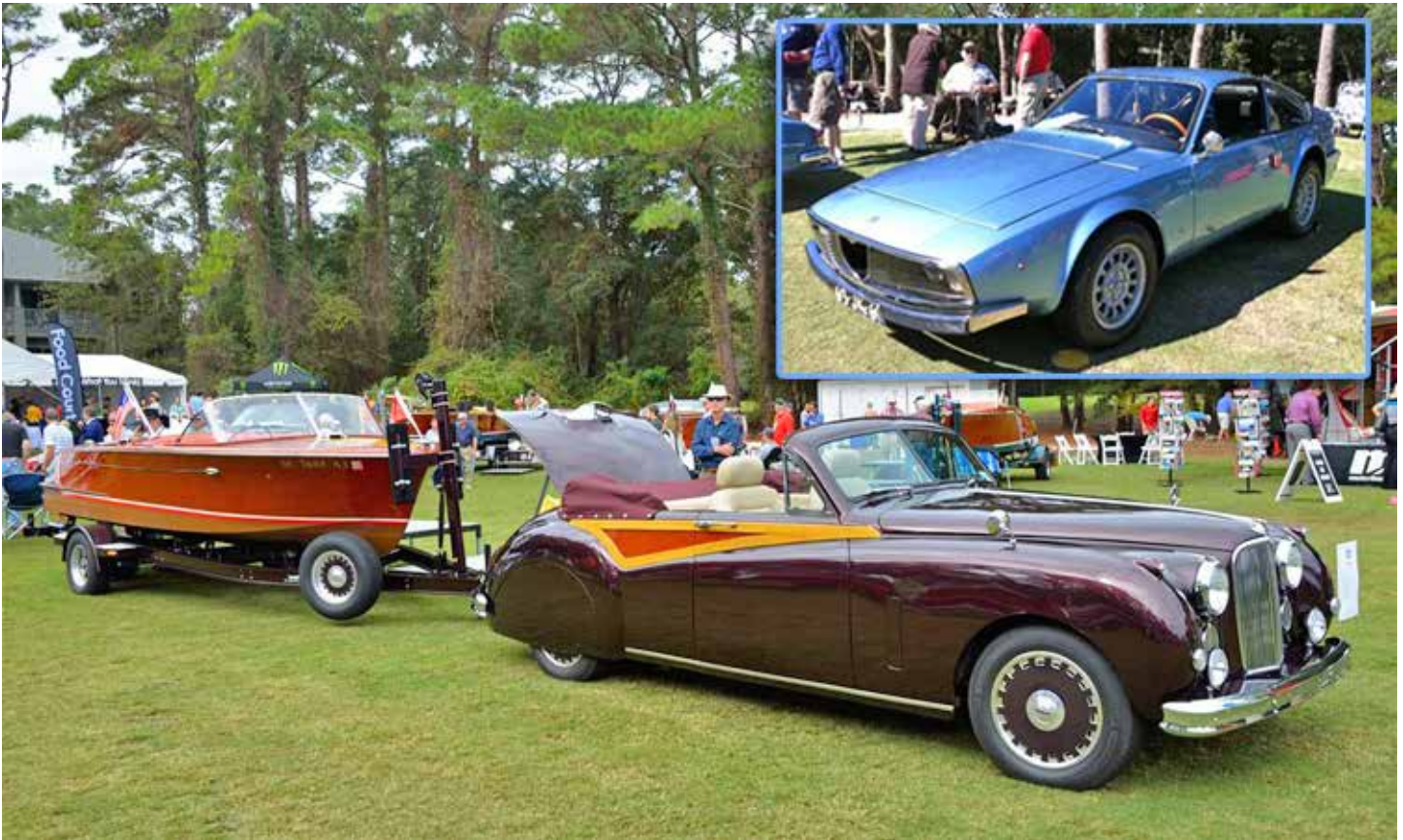
Continued on page 7