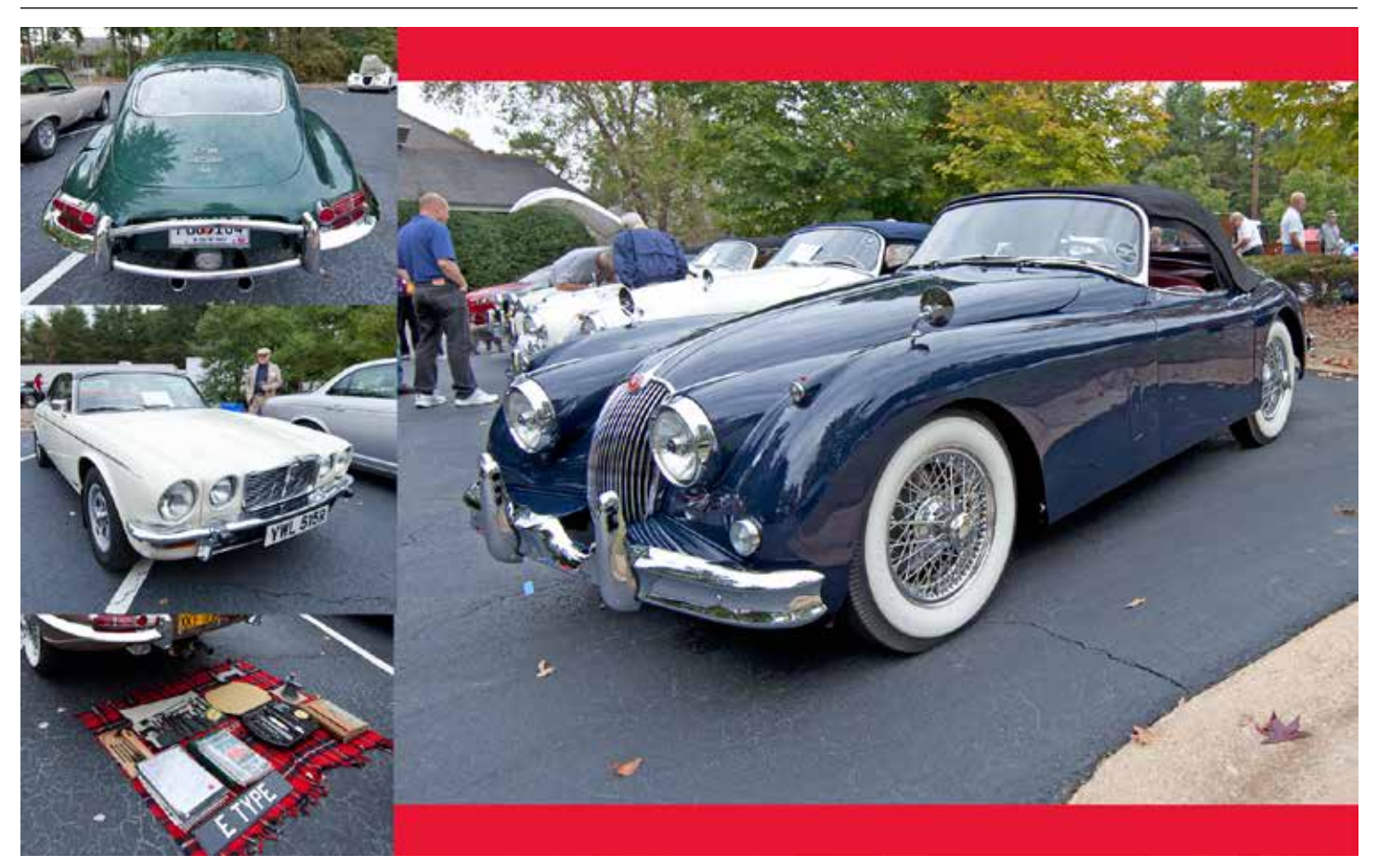
Continued on page 5