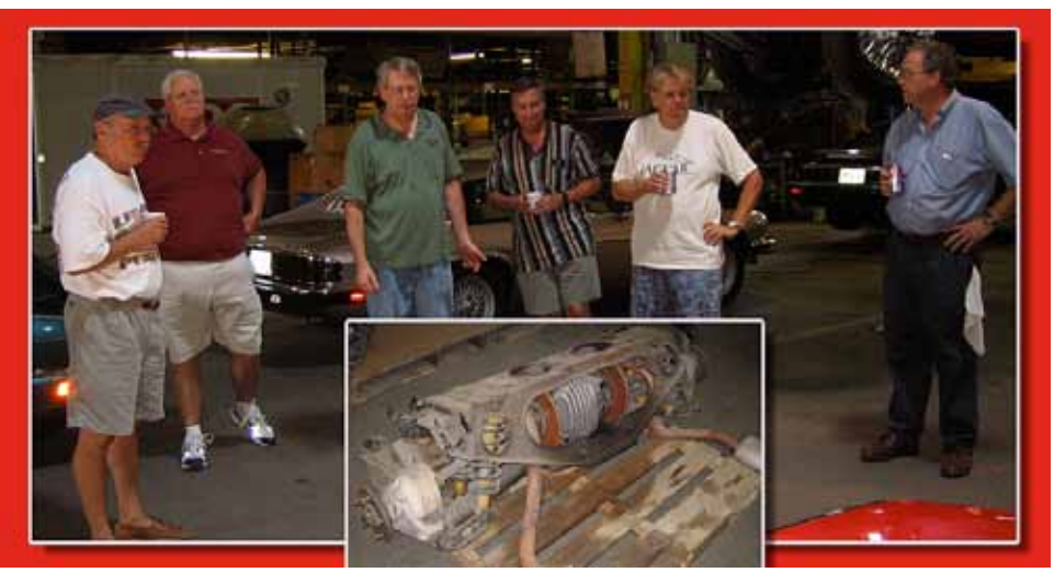
Ladies aren't you glad you missed this tech session! More starting on page 6