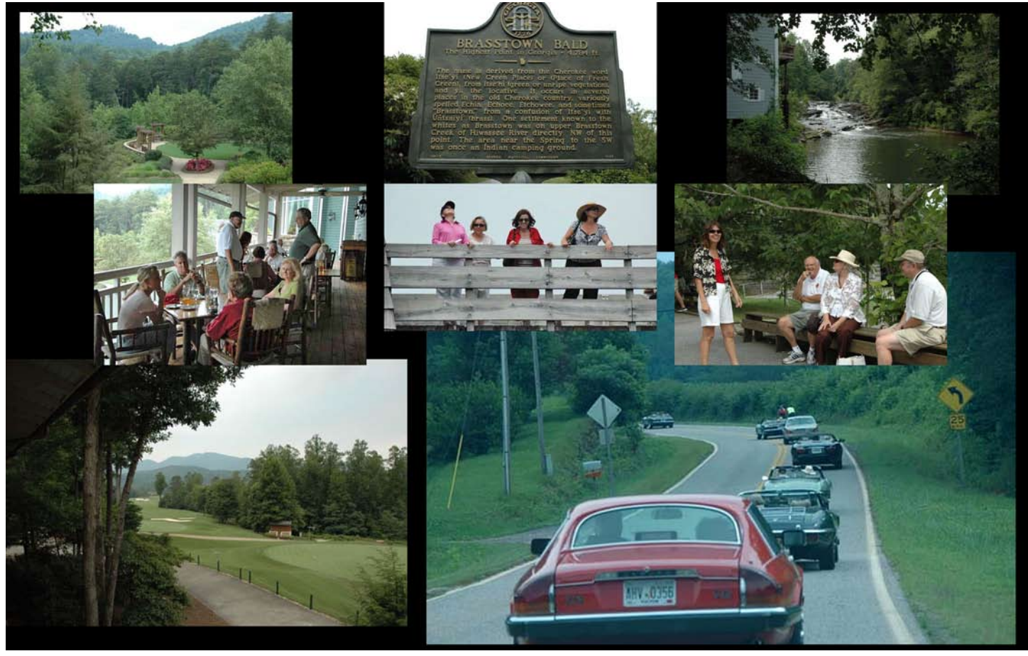
Continued from page 7