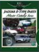
E-TYPE PARTS AND ACCESSORIES