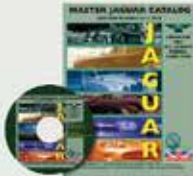
INDUSTRY STANDARD MASTER JAGUAR CATALOG