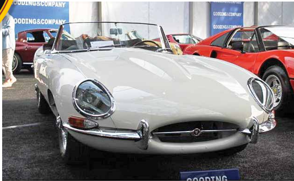
See the article: Two Legends Part on page 4