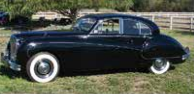
EARLY SEDAN PARTS AND ACCESSORIES