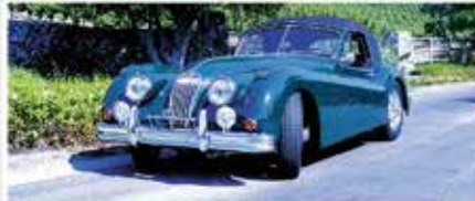
"XK" PARTS AND ACCESSORIES