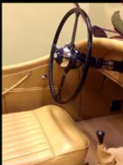
1952 XK120 OTS, restored by Speedwell Engineering.

Speedwell Engineering LTD, Restoration, Sales and Service of collectable automobiles 964, Sixes Road, Canton GA 30114 (770)789-1396.