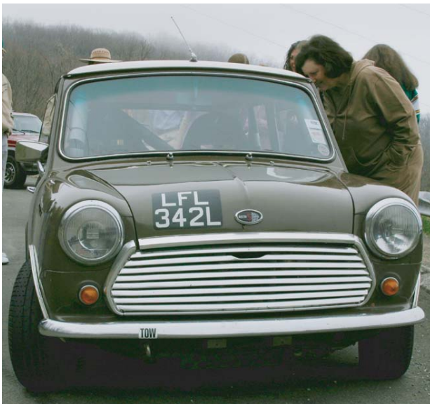
An Austin Mini Cooper S with an Italian pedigree stopped when he saw our Cats at Burnt Mountain Overlook .