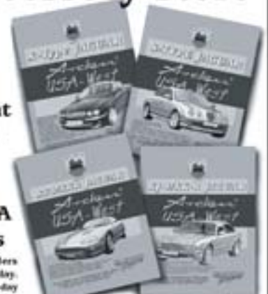
Full color Arden® brochures for XK8, XJ8, S-TYPE AND X-TYPE

* XKs' normal policy is to fill and ship orders received before 2:00 pm, Pacific time, the same-day. Unforeseen circumstances may cause delays, next-day shipping may result in some cases.