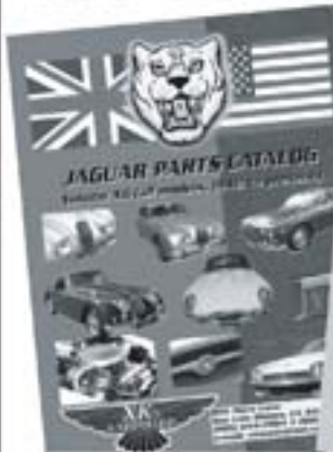
384 page Vol. XII, Jaguar Parts Catalog