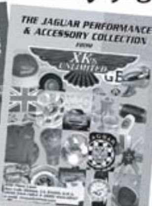
80 page Vol. I, Jaguar Performance & Accessory Collection