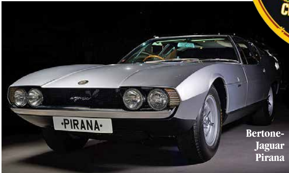
Bertone- Jaguar Pirana