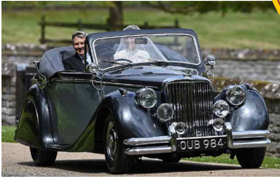
Pippa Middleton's Wedding article inside