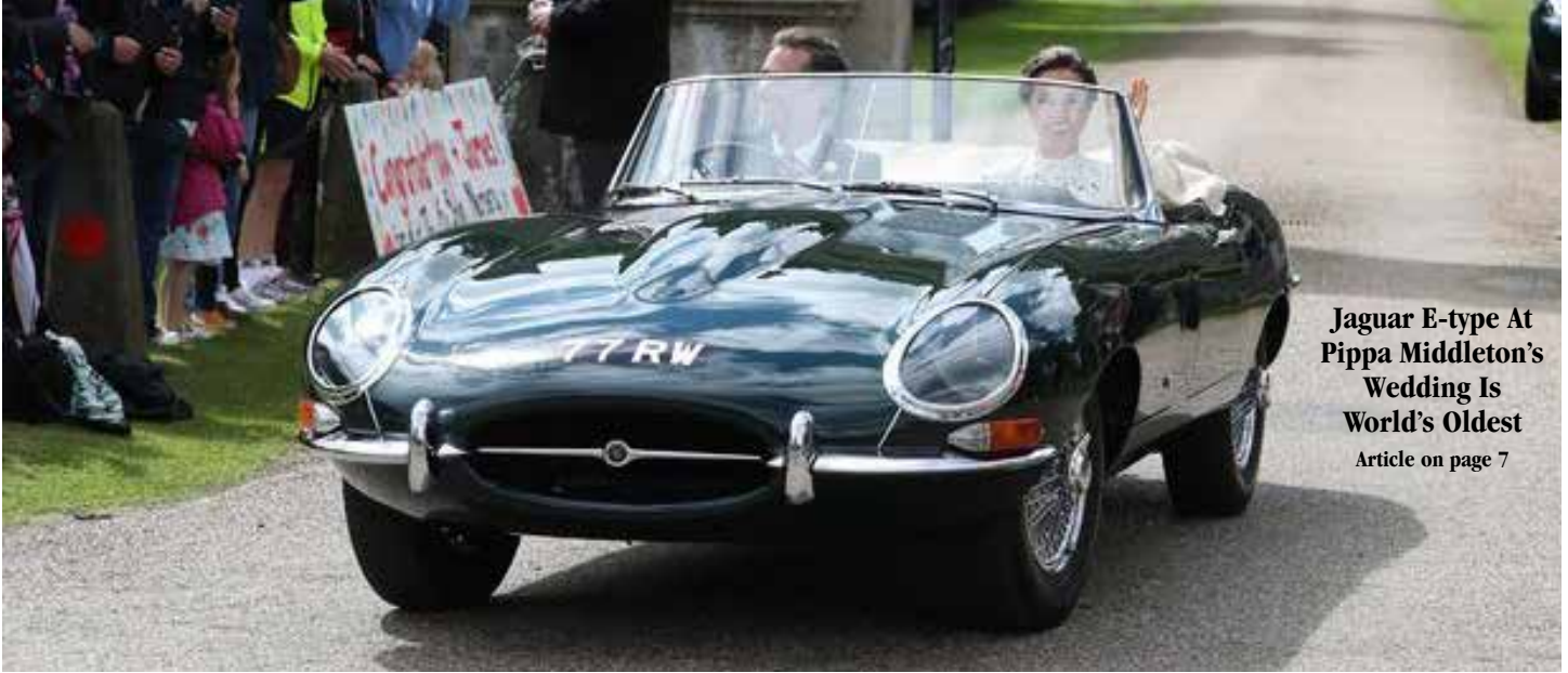
Jaguar E-type At Pippa Middleton's Wedding Is World's Oldest Article on page 7