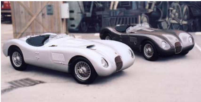
D-Type Repros or are they the real McCoy?

The country club does request that guests in the main clubhouse wear collared shirts. There is a large covered pool pavilion adjacent to where our cars will be parked so there should be plenty of shade for sitting and socializing. This area will be reserved for our use only that day. If you have other questions, call or e-mail Roy.