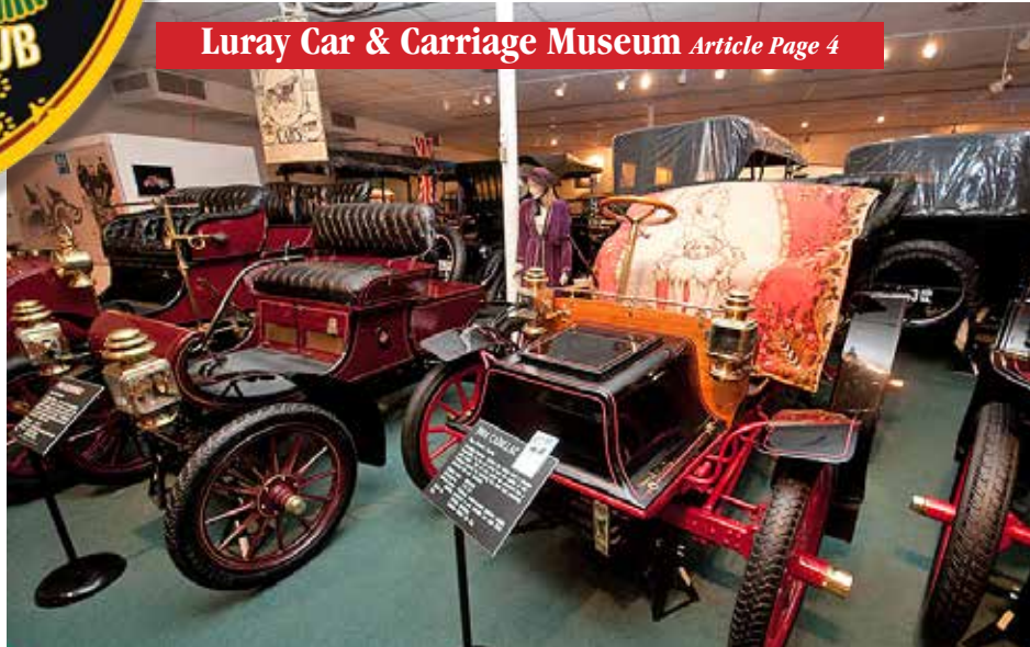
Luray Car & Carriage Museum Article Page 4