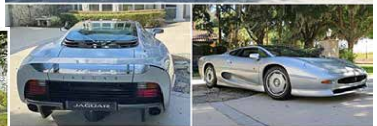
1993 Jaguar XJ 220 Ian Crawford—Longwood, FL