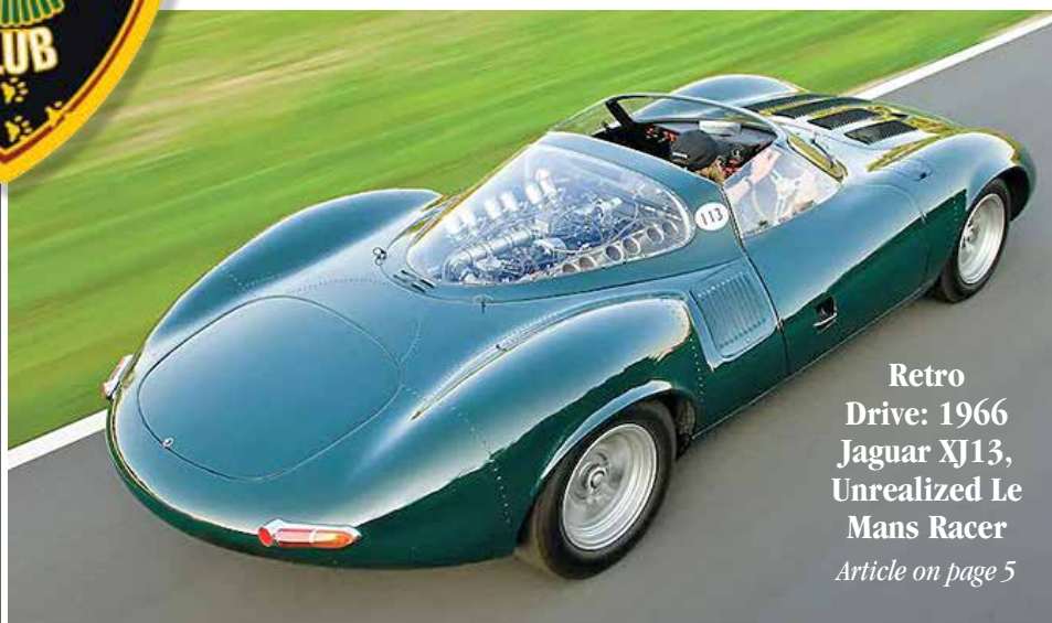
Retro Drive: 1966 Jaguar XJ13, Unrealized Le Mans Racer Article on page 5