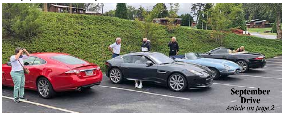
September Drive Article on page 2