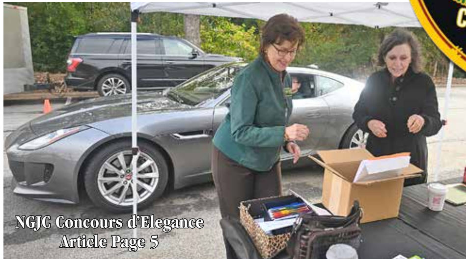
NGJC Concours d'Elegance Article Page 5