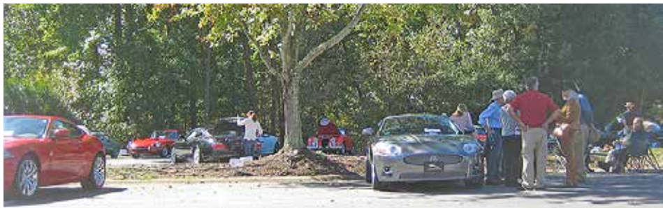
Sunday, December 15th NGJC Christmas Party