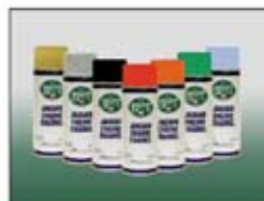
Cylinder Head Paint

Authentic shades to add original feel. Available in 16 fl oz/400ml red, black, orange, silver, pastel green, gold & metallic blue.