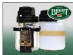
E-Type Washer Bottles

Made exclusively by us and sold the world over!!!