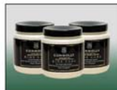
Connolly Hide Food

The original and probably the best! Keeps your leather soft and supple in the hot Summer sun.