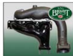
E-Type Exhaust Manifolds

Why repair or re-enamel when a new manifold is available?