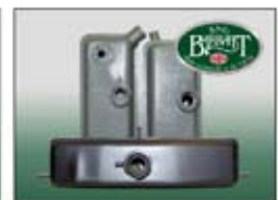
Full Range of E-Type Header Tanks