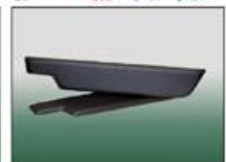
Roadster Sun Visors