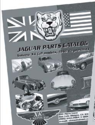
384 page Vol. XII, Jaguar Parts Catalog