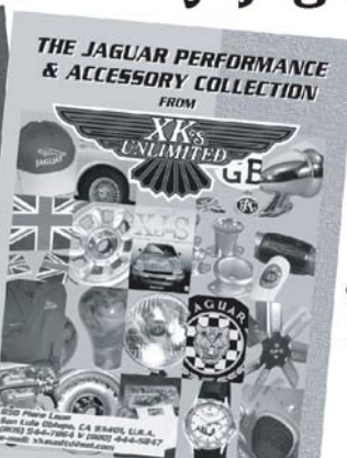
80 page Vol. I, Jaguar Performance & Accessory Collection