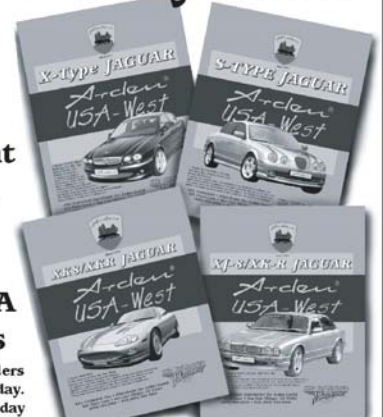
Full color Arden® brochures for XK8, XJ8, S-TYPE AND X-TYPE

* XKs' normal policy is to fill and ship orders received before 2:00 pm, Pacific time, the same-day. Unforeseen circumstances may cause delays, next-day shipping may result in some cases.