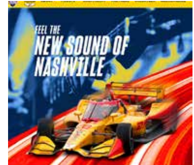
This is the Nashville Grand Prix weekend.