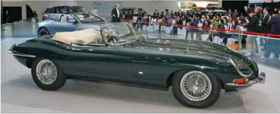
The first roadster 77 RW, and the last, HDU 555N