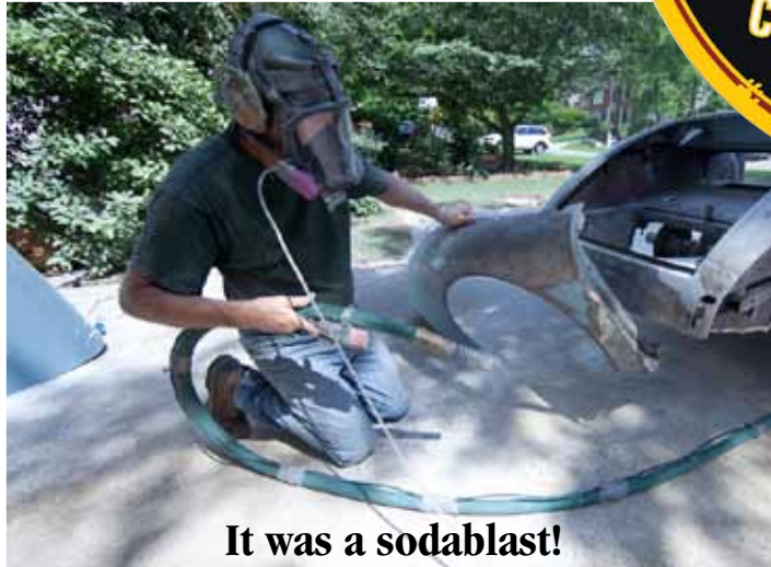
It was a sodablast!