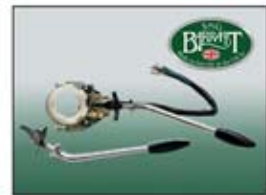
Late Indicator Switch & Chrome Arm

Sometimes cracked, often yellowed with flaking chrome. Get an interior light that actually illuminates and looks good too! Complete £11 €13 $17