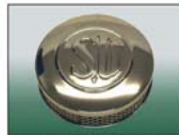
Chrome SU Pancake Air Filters

Smoking is out of fashion, but you still need to fill the hole in your dashboard!!! All models £19 €24 $30