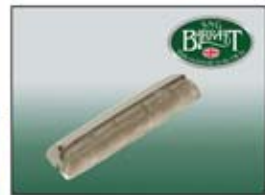
Interior Light Lens & Cover

Sometimes cracked, often yellowed with flaking chrome. Get an interior light that actually illuminates and looks good too! Complete £11 €13 $17