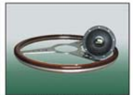
Metalita Steering Wheel

Made in the USA to very high specification with stainless spokes & nipples. Curly hub to '67 £215 €271 $315 Flat hub '67 on £215 €271 $315 *Wheels with wider rims available, call for pricing.