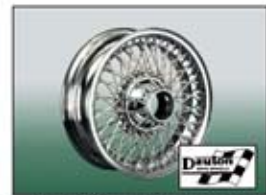
Dayton Chrome Wire Wheels*

These really look the part and make a nice alternative to the standard air filter. Best is, they really work, unlike some! HD6 carbs £39 €49 $62