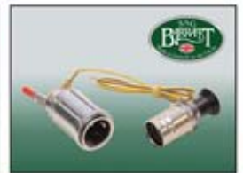
Cigar Lighter Assembly

If it's broken buy the whole thing. If it's just a question of worn chrome, just buy the arm! Switch £120 €151 $192 Arm £30 €38 $49