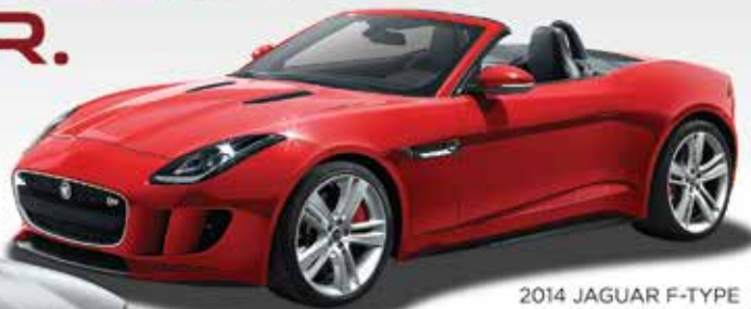
2014 JAGUAR F-TYPE