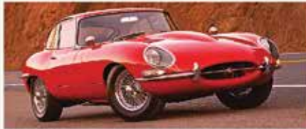
E-TYPE PARTS AND ACCESSORIES