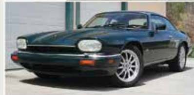
LATE-MODEL PARTS AND ACCESSORIES