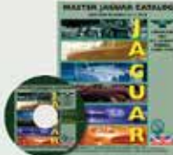
INDUSTRY STANDARD MASTER JAGUAR CATALOG