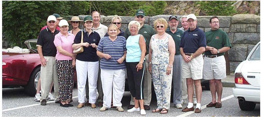
Some of NGJC and SMJC Members at Newfound Gap