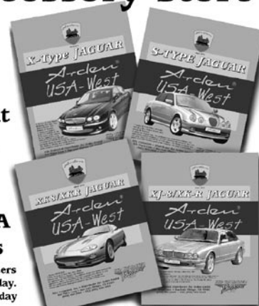
Full color Arden® brochures for XK8, XJ6, S-TYPE AND X-TYPE

* XKs' normal policy is to fill and ship orders received before 2:00 pm, Pacific time, the same-day. Unforeseen circumstances may cause delays, next-day shipping may result in some cases.