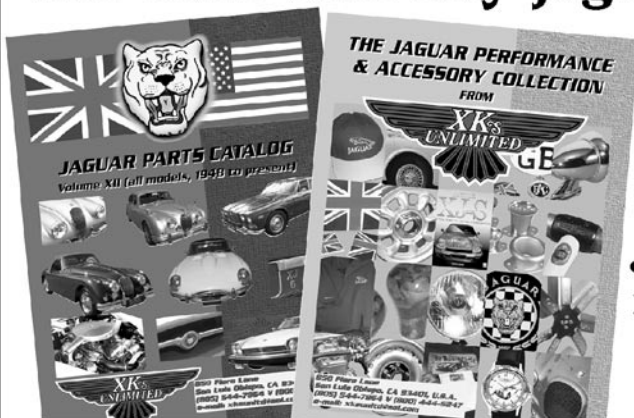
384 page Vol. XII, Jaguar Parts Catalog