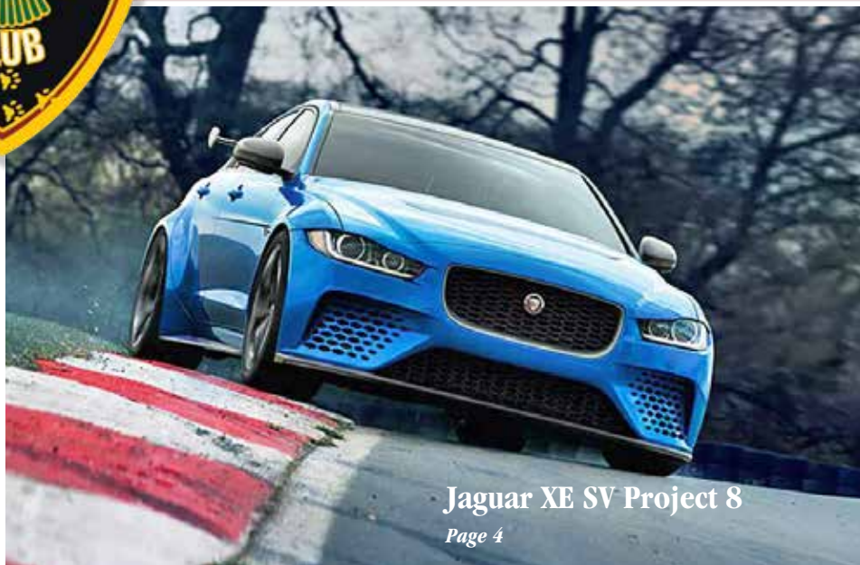
Jaguar XE SV Project 8