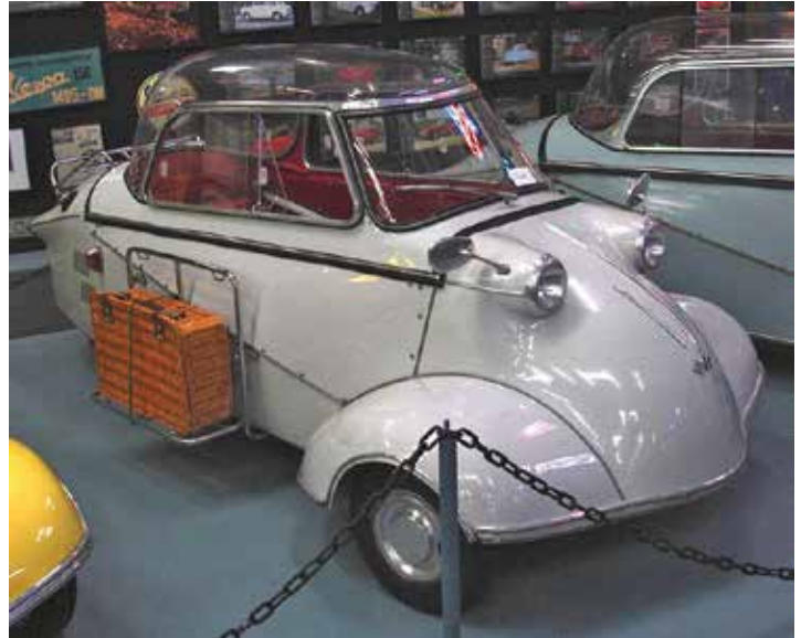
PAGE 6 - Visit To Microcar Museum