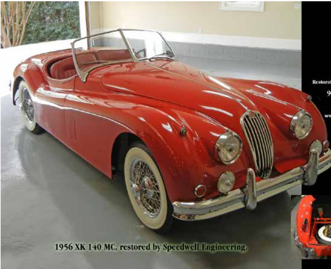
1956 XK 140 MC, restored by Speedwell Engineering.