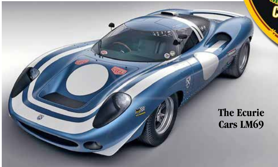
The Ecurie Cars LM69