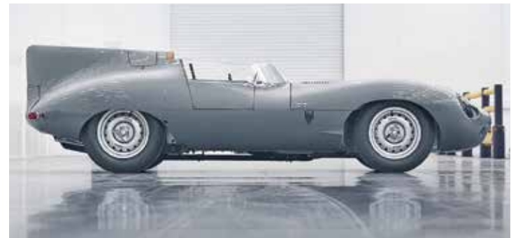
Jaguar Classic D-Type makes its debut at Rétromobile 2018 in Paris