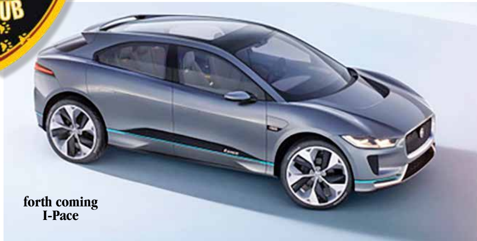
forth coming I-Pace