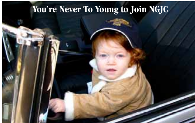
You're Never Too Young to Join NGJC