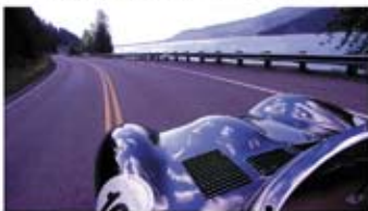
2nd prize- Chuck Goolsbee, Washington, USA.