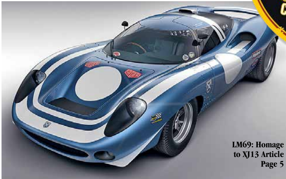
LM69: Homage to XJ13 Article Page 5